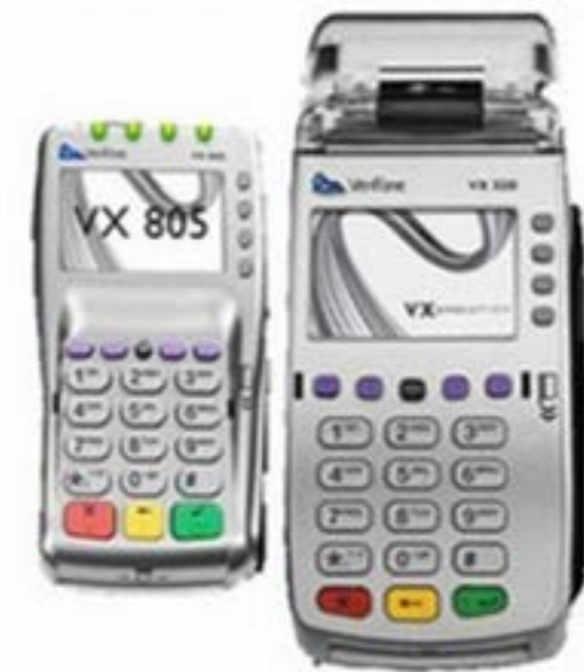
VX 520 and VX 805 Bundle