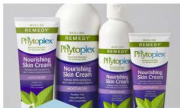
Skin Care & Cleansing