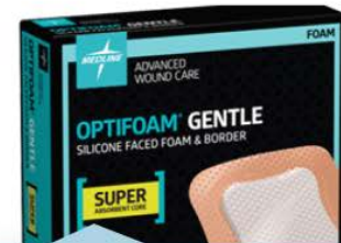
Advanced Wound Care