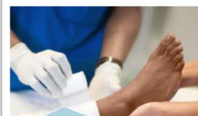
Traditional Wound Care