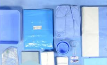
Sterile Procedure Trays