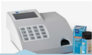
Point of Care