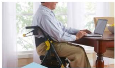
Durable Medical Equipment